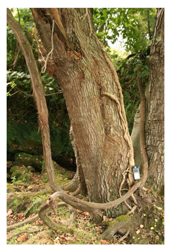
Fig. 2: Exemplar of wild grapevine climbing on its botanical supporter in the Deva river bank forest.

also in very residual places conserving small rests of natural vegetation within urban areas, the main supporters are: Ficus carica, Fraxinus excelsior, Laurus nobilis, Prunus spinosa, Rosa canina, Rosa sempervirens, Rubus ulmifolius, Salix alba, Sambucus nigra and Ulex europaeus.