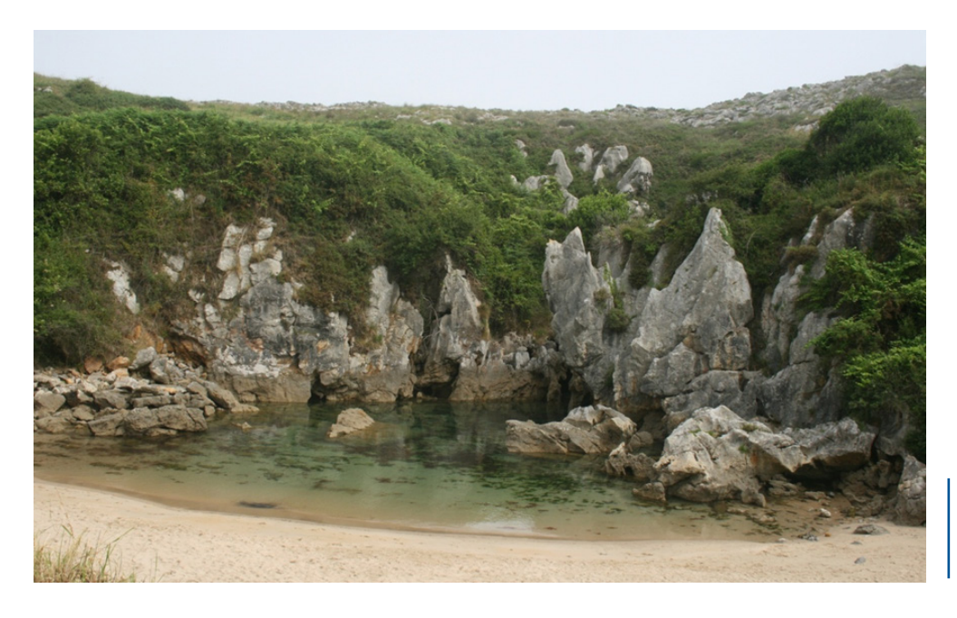
Fig. 4: The karstic landscape of Gulpiyuri beach, where the grapevines grow on the calcareous wall above the high tide level.

About the traditional uses of wild grapevine in Asturias, the only testimony found was the construction of hoops of fishing traps for lobster around Toranda beach.