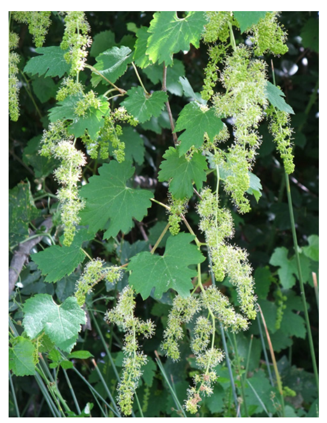
Fig. 5: Male vine at flowering time (June).

Male individuals show a higher number of inflorescences per shoot (Fig. 5), with flowers that generally present fully developed stamens and no gynoecium (flower Type 1, according to OIV 2009). On the other hand, female flowers show reflexed