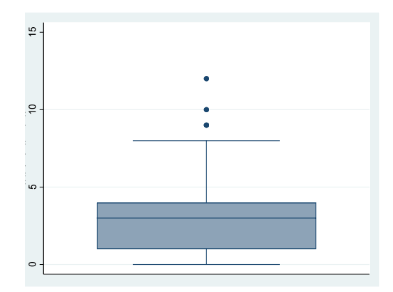
Figure 3. Coping strategies.