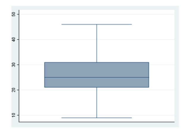
Figure 1. Stressors.