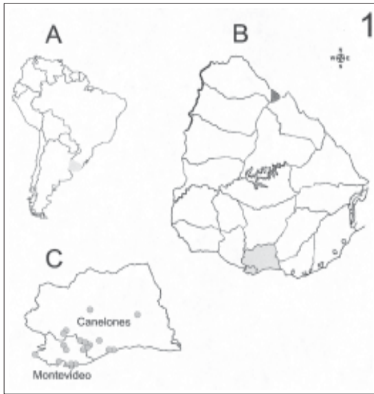
Figure 1. Map of South America (A), Uruguay (B) and the sampling area (C). The squares in each map reflect the area subsequently magnified. Dots show the localities of captures.

with highest numbers on dogs in February. Ehrlichia -derived DNA was not detected in the 36 pools of ticks sampled.