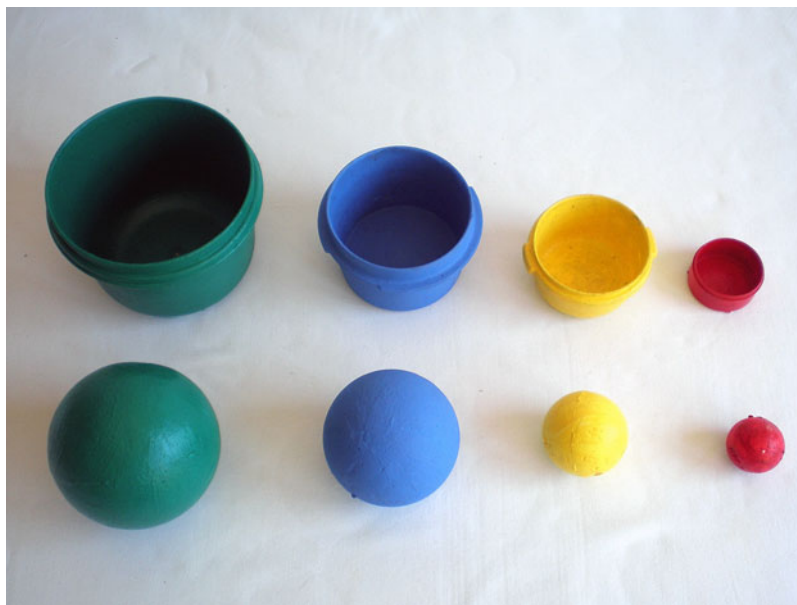
Figure 1. Facilitating task: Stimulus material.

The validity of the observation instrument was calculated using the GT software (Ysewijn, 1996), although it was first necessary to use the SAS 9.1.3 package Procedure VARCOMP (Schlotzhauer & Littell, 1997).