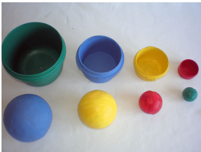
Figure 3. Interfering task: Stimulus material.

Through different semisystematization processes—the final process consisting of a list of distinctive features—these narrative recordings allowed us to identify the different actions that were developed by the children studied. These distinctive features included the following: grouping, pulling, putting a ball in a beaker, no activity, no action and not focusing on the materials, the repetition of an action without paying attention, putting a ball in a beaker and removing it quickly, fitting together, making towers, or putting two balls in the same box.